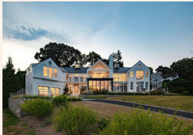
East Coast Structures & Chris Pagliaro Architects