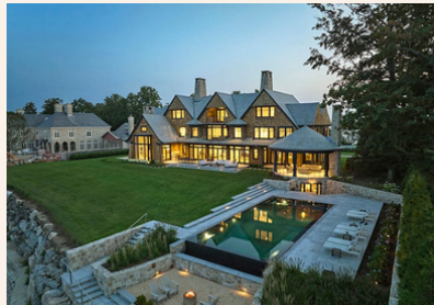
Yankee Custom Builders & Vanderhorn Architects