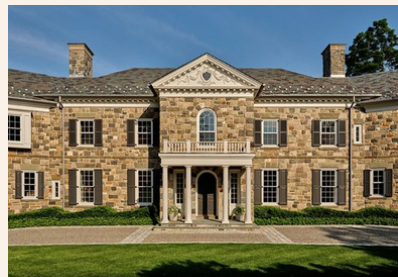
Yankee Custom Builders & Brooks & Falotico